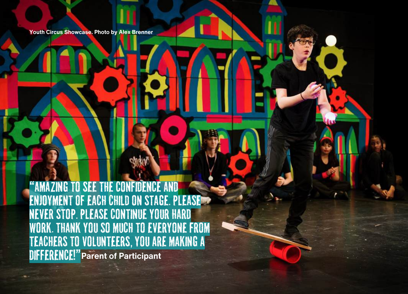
Youth Circus Showcase.

“AMAZING TO SEE THE CONFIDENCE AND ENJOYMENT OF EACH CHILD ON STAGE. PLEASE NEVER STOP. PLEASE CONTINUE YOUR HARD WORK. THANK YOU SO MUCH TO EVERYONE FROM TEACHERS TO VOLUNTEERS, YOU ARE MAKING A DIFFERENCE!” Parent of Participant