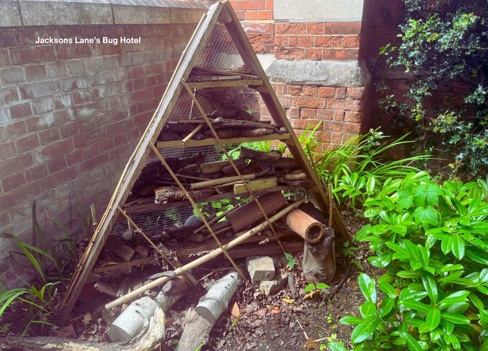
Jacksons Lane's Bug Hotel