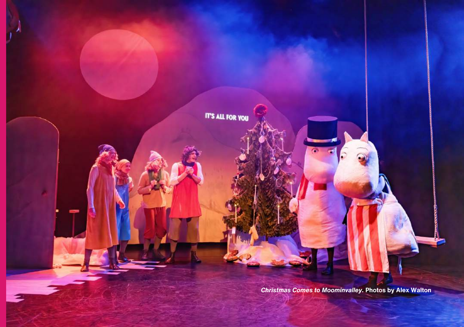
Christmas Comes to Moominvalley.