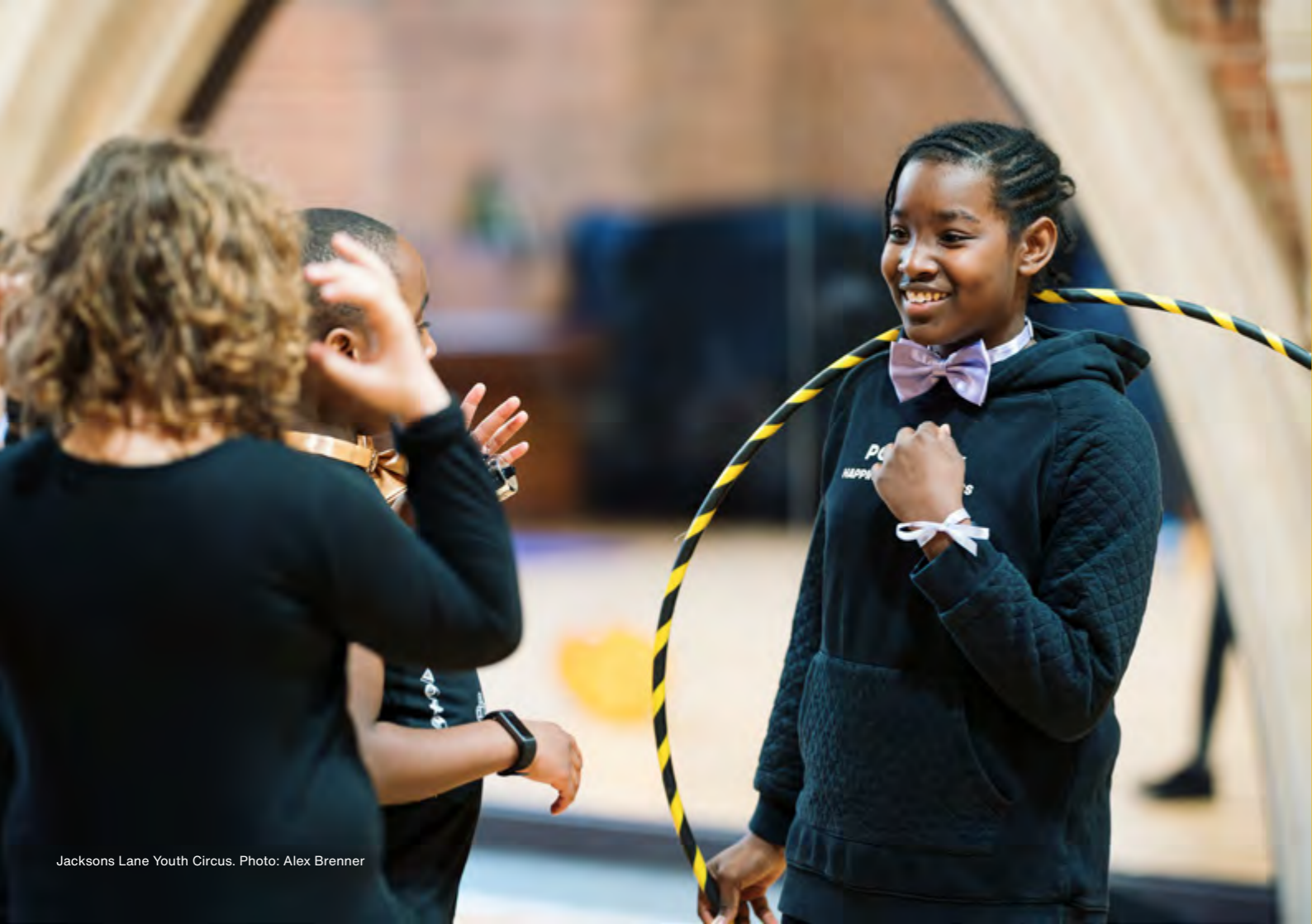
Jacksons Lane Youth Circus.