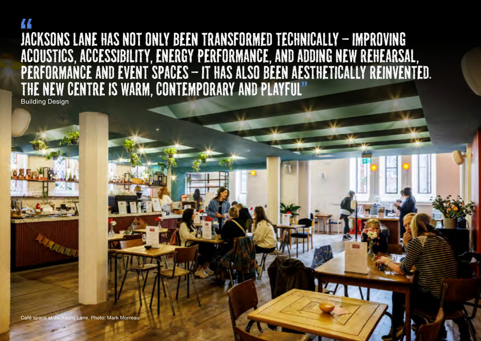
Café space at Jacksons Lane.