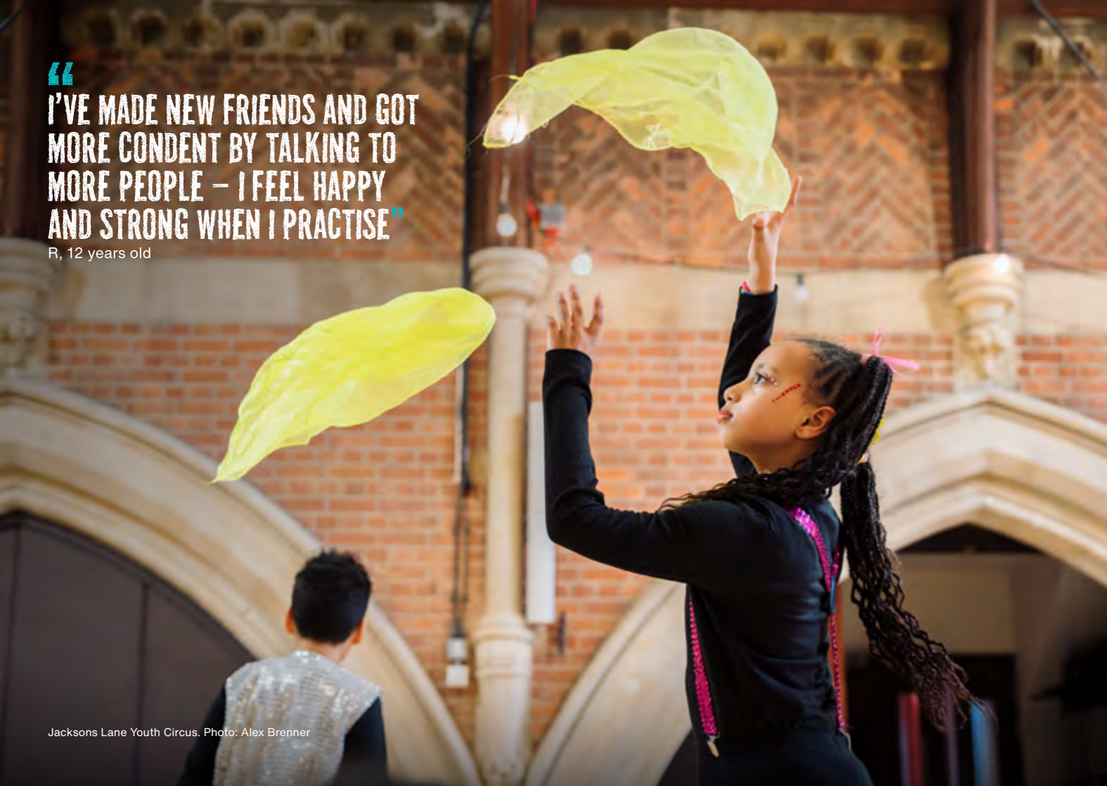
Jacksons Lane Youth Circus.