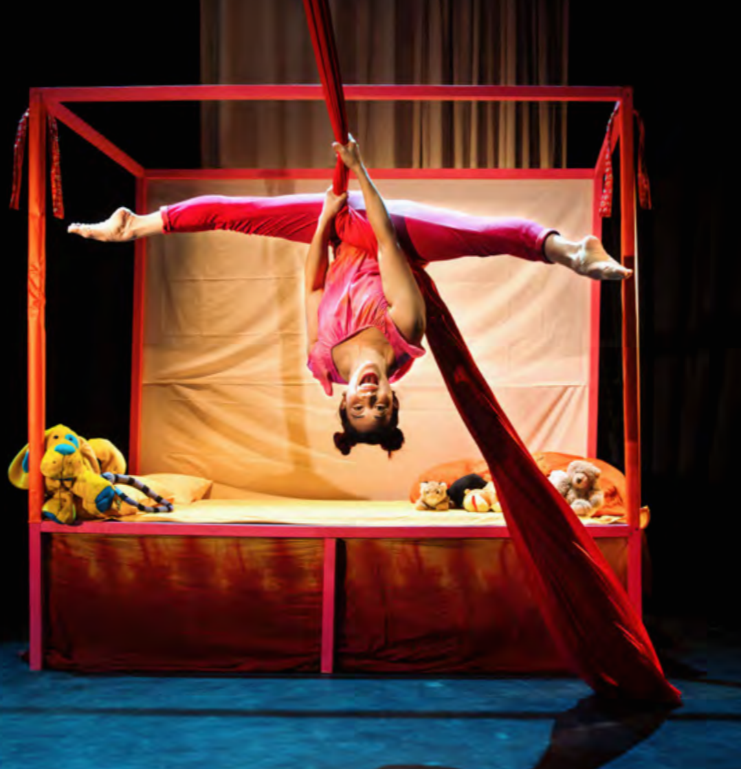
Jack and the Beanstalk.

Audience member on Jack and the Beanstalk