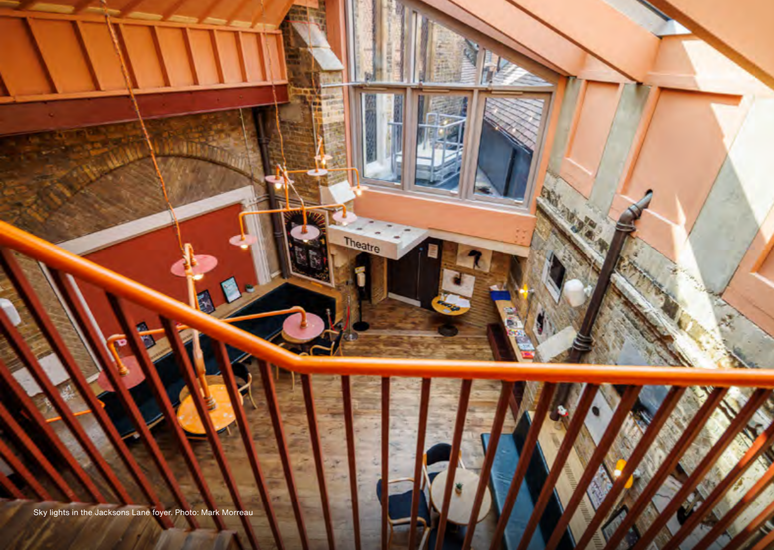
Sky lights in the Jacksons Lane foyer.